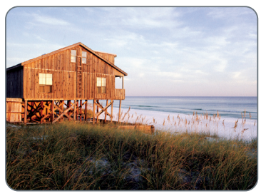
Home and Remote Locations